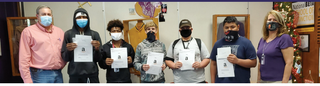
Fall 2020 Okeechobee High School winners

The Florida Stock Market Challenge is an exciting way to engage elementary, middle, or high school students while presenting lessons across the curriculum...economics, social studies, math, reading comprehension, CTE and personal finance. Established more than 30 years ago, the Florida Stock Market Challenge gives K-12 students the opportunity to participate in an online investment simulation and manage a hypothetical $100,000 investment portfolio.